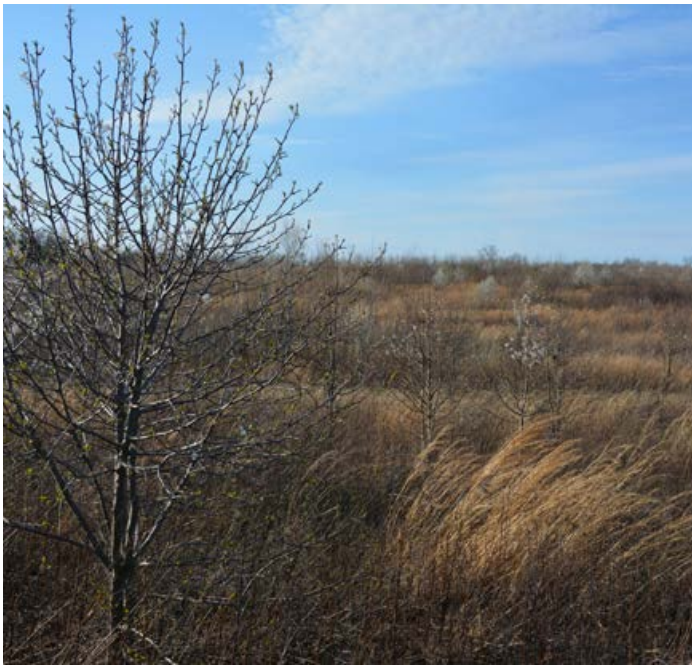
The trees with white flowers invading this old-field in southern Indiana are Callery pears. Pears are easy to identify in the spring, because they generally are the first trees to flower. This picture was taken in early March, prior to most trees breaking dormancy.

Callery pear. Callery or Bradford pear is an ornamental tree used widely in residential landscaping. Originally thought to be incapable of reproducing naturally, varieties of callery pear can cross-pollinate and have become extremely invasive and commonly invade NWSG stands. It typically appears sporadically, but then forms extremely dense clumps that outcompete native herbaceous and woody vegetation. You should aggressively try to control this plant. Callery pear can be killed with glyphosate (2% solution [2.6 oz/gal of water]), imazapyr (Arsenal®, 1.5% solution [2 oz/gal of water]), metsulfuron methyl (1 g/gal of water), or triclopyr (Garlon 4®, 2–4% solution [2.5–5 oz/gal of water]).