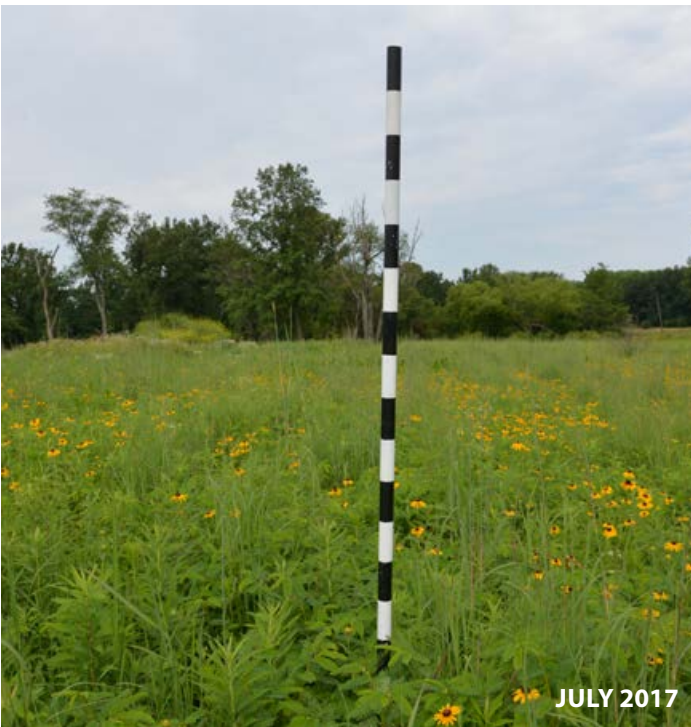
Glyphosate applied in September at 2 qt/ac followed by a March prescribed fire effectively reduced the amount of native grass in the field and increased the amount of forbs. The fire also helped to remove the thatch left by the herbicide application.