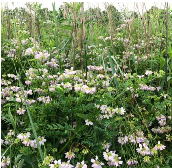
Crown vetch is commonly found along roadsides, but also invades NWSG stands.

Crownvetch is a nonnative perennial legume often promoted for erosion control and as a forage for cattle. However, crownvetch is very invasive and quickly invades NWSG stands. Eventually, crownvetch will outcompete native vegetation and form a monoculture. Crownvetch is a cool-season plant and can be controlled when most desirable warm-season vegetation is dormant. Crownvetch is best controlled with products containing triclopyr (1 qt/ac), metsulfuron methyl (0.5 oz/ac), or aminopyralid (5–7 oz/ac). Small infestations also can be controlled with glyphosate (2 qt/ac) or 2,4-D (4–6 pt/ac).