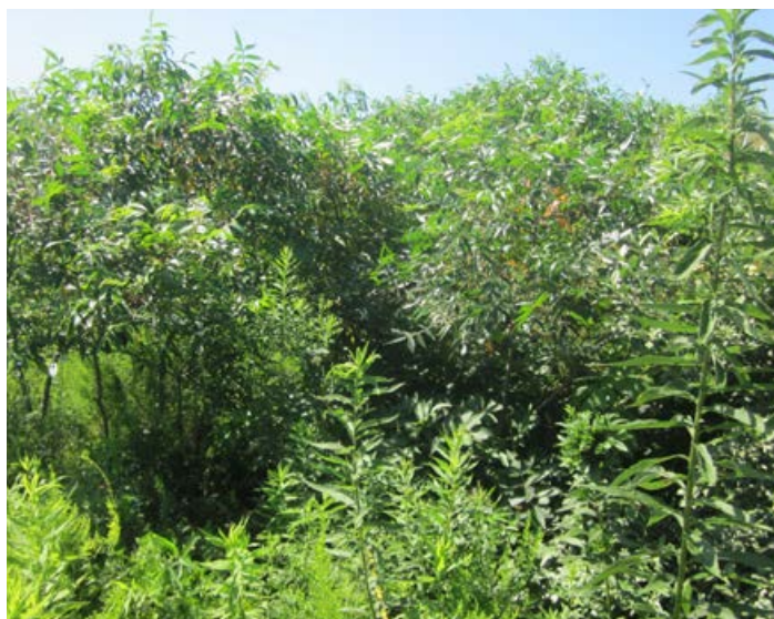
Sumac mottes provide excellent thermal cover during the heat of the summer for bobwhite, turkeys, and white-tailed deer. However, sumac can become too dense if not managed.