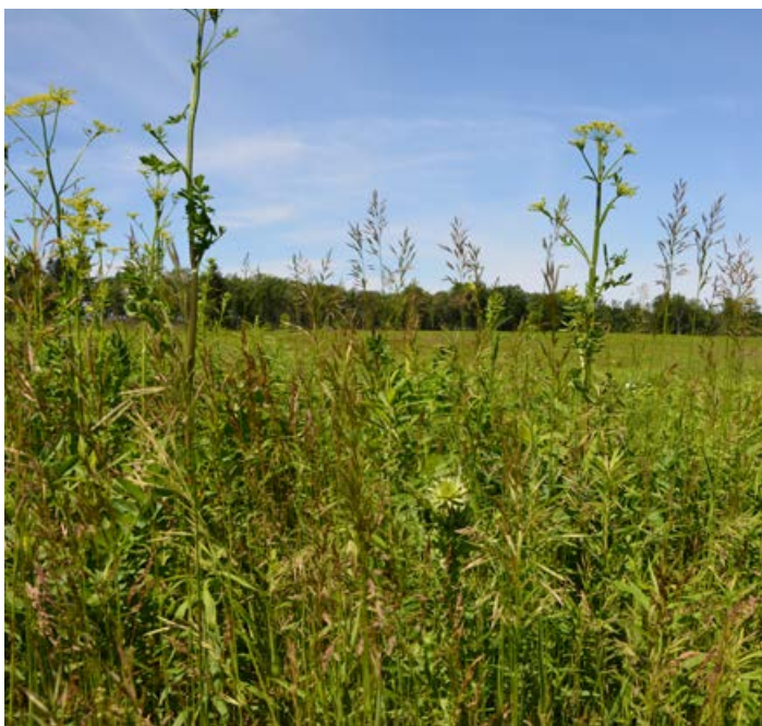
Numerous undesirable plants are outcompeting desirable plants in this field. Cool-season perennial grasses, such as smooth brome, tall fescue, and Kentucky bluegrass as well as problematic forbs such as wild parsnip and musk thistle have invaded this field.

Herbicide application typically is the most efficient way to treat undesirable plants in NWSG stands, because you often can selectively treat those plants without killing desirable plants across the whole field. Various nonnative and invasive species respond differently to disking and prescribed fire. However, disking and fire can be used when appropriate for various species. There are many more problematic nonnative plants than the ones discussed below, but these include some of the most common problem plants in NWSG stands.