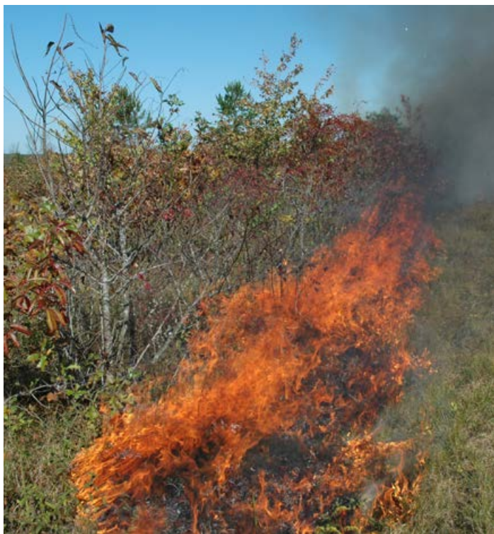
Late-growing season is the most effective time to conduct prescribed fire with the objective of reducing woody encroachment.

Frequent dormant-season fires (1–2 yr return intervals) may limit woody encroachment and control certain invasive species, but it also will increase native grass density and lead to reduced forb abundance. Infrequent dormant-season fire will top-kill woody stems, but these stems readily resprout. Burning during the latter portion of the summer/early fall (August–October) tends to control woody encroachment better than during the dormant season or early portion of the growing season. However, a single fire rarely causes dramatic shifts in plant composition. Multiple fires are required to see considerable reduction in woody encroachment. Fire may not be possible in some areas, and woody encroachment may advance beyond what is feasible to control with a single prescribed fire, and an herbicide application or mechanical treatment may be warranted.