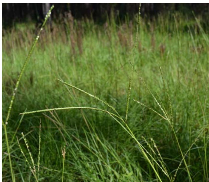
Various warm-season grasses, including bahiagrass (pictured), can also be problematic in NWSG stands. Herbicides are the best option to control these species.

Other problematic nonnative warm-season grasses include bahiagrass, bermudagrass, Chinese silvergrass ( Miscanthus spp.), cogongrass, crowngrasses ( Paspalum spp.: dallisgrass and vaseygrass), large crabgrass, jangrass, and old world bluestems. Bahiagrass and bermudagrass are forage grasses most commonly planted in the southeastern United States, but bermudagrass occurs throughout the eastern United States. Jangrass is a common invasive annual grass in forested areas, but it can invade NWSG stands. Ideally, these species should be controlled with herbicides prior to planting, but they also commonly encroach into established NWSG stands. Some of these grasses can be controlled without harming some planted native grasses, but others require herbicides that also kill planted native grasses. Grass-selective herbicides generally are not effective at controlling perennial grasses.