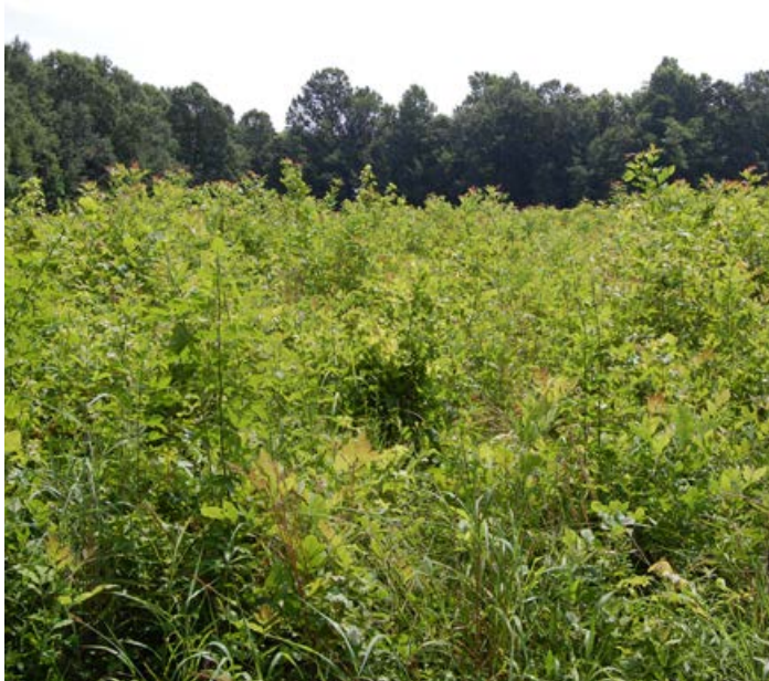
This field is quickly being overtaken by sweetgum, green ash, and red maple. Without management, this field is on its way to becoming a young forest.

Native shrub species, such as plums, hawthorns, elderberry, dogwoods, sumacs, leadplant, and false indigo, are extremely attractive to many wildlife species that need woody cover and make planted NWSG fields much more desirable to these species. However, you need to provide the correct amount of woody cover in an attractive arrangement for various focal species, and as succession advances, even some of these shrubs can become too dense for various species and management will be needed to control them.