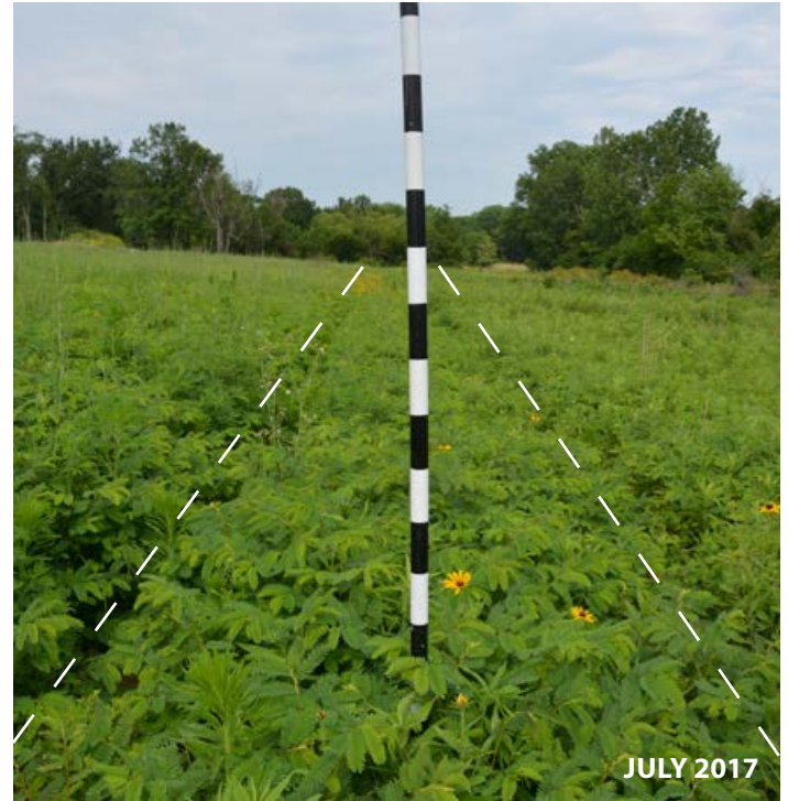
Tilling the firebreak (in between the dashed lines) resulted in a dramatic composition change compared to the portions of the field that were only burned in March. We went from a rank stand of native grasses to a stand dominated by annual forbs such as partridge pea, common common ragweed, and blackeyed Susan.