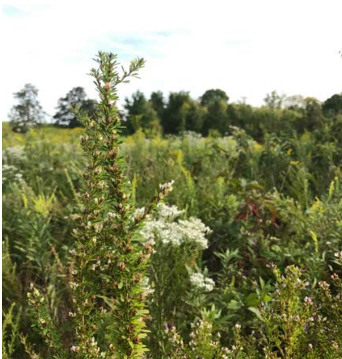
Sericea lespedeza is arguably one of the most problematic invaders in NWSG stands. Sericea flowers in August or September and is a prolific seed producer, but the seeds have no value to wildlife because they are indigestible.

Herbicides to control sericea lespedeza . Glyphosate (1–2 qt/ac), triclopyr (1 qt/ac), or a combination of triclopyr and fluroxypyr (Pastureguard HL® 1.5 pt/ac) provide control of sericea lespedeza throughout the growing season. However, aminopyralid (used to control thistles) is not effective in controlling sericea . Metsulfuron methyl (1 oz/ac) may be applied August through September when greater than 50% of the sericea lespedeza is in flower and after some desirable forbs have set seed. Applications at this time may have less detrimental effects to existing forbs, but they also are not as effective as other herbicide applications. Regardless of the herbicide used, multiple applications will be needed to control sericea in a stand. We recommend treating infestations with triclopyr and fluroxypyr when sericea is 12–18 inches in height (June–July) and then respraying any remaining sericea with metsulfuron methyl during flowering (August–September).