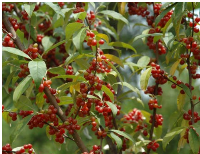
Nonnative olives are commonly spread across NWSG fields by birds dispersing seed. Olives can quickly invade open areas and they should be controlled with herbicide.

Nonnative olives. Nonnative olives (autumn, silverthorn, Russian, and others) are woody shrubs commonly planted in the mid-20th century to provide cover and food for wildlife. When occurring adjacent to a NWSG field, they usually spread throughout the field and may create dense thickets within the field, which can be desirable for some wildlife species, but they are problematic as an invasive species. Nonnative olives can be controlled with foliar applications of triclopyr (Garlon 4®, 4–8 qt/ac) or imazapyr (Arsenal®, 4–6 pt/ac), whereas glyphosate and metsulfuron methyl typically provide limited control.