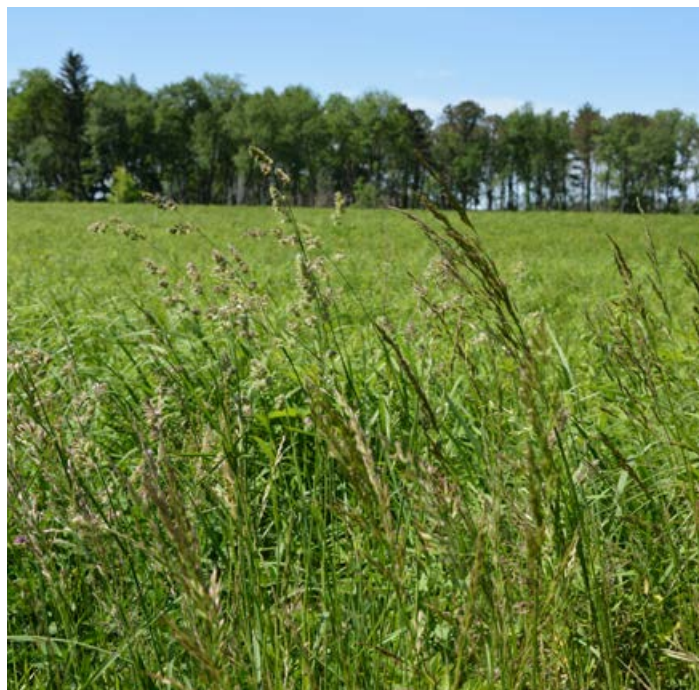
Cool-season grasses, such as tall fescue, orchardgrass, and smooth brome, quickly invade NWSG stands, especially in stands where they were not adequately controlled prior to planting. Cool-season grasses change the structure of the stand at ground level and impede movement and foraging of ground-dwelling wildlife.

Nonnative cool-season grasses including tall fescue, smooth brome, Kentucky and roughstalk bluegrass, timothy, orchardgrass, quackgrass, and reed canarygrass commonly invade NWSG stands, especially when not properly controlled prior to establishment. Taking the time to effectively control cool-season grasses prior to planting with both fall and spring herbicide applications can help mitigate problems later in the life of the planting. Cool-season grasses limit mobility and foraging of upland game bird broods and suppress native vegetation. Cool-season grasses probably are the most common and problematic invaders of early successional areas, but because of differences in phenology (timing of growth) between cool-season and warm-season grasses, cool-season grasses are easily controlled in NWSG stands.