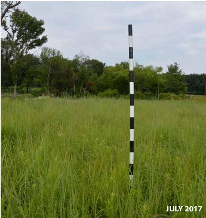
Clethodim applied in September at 16 oz/ac followed by a March fire did not reduce the amount of native grass in the field or increase the amount of forbs.