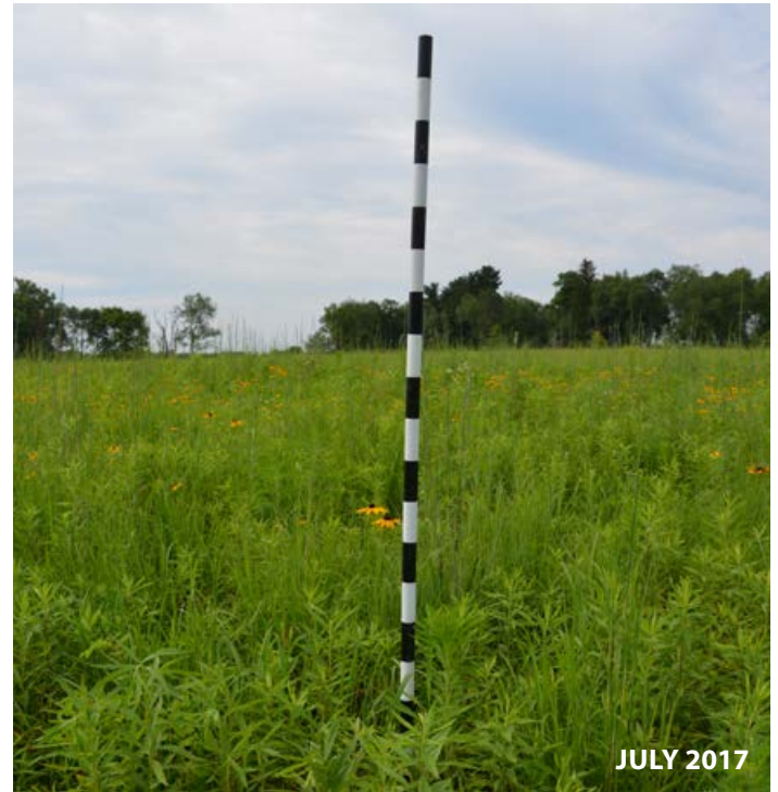
Imazapyr (Arsenal®) applied in September at 48 oz/ac followed by a March prescribed fire effectively reduced the amount of native grass in the field and increased the amount of forbs. The fire also helped to remove the thatch left by the herbicide application.