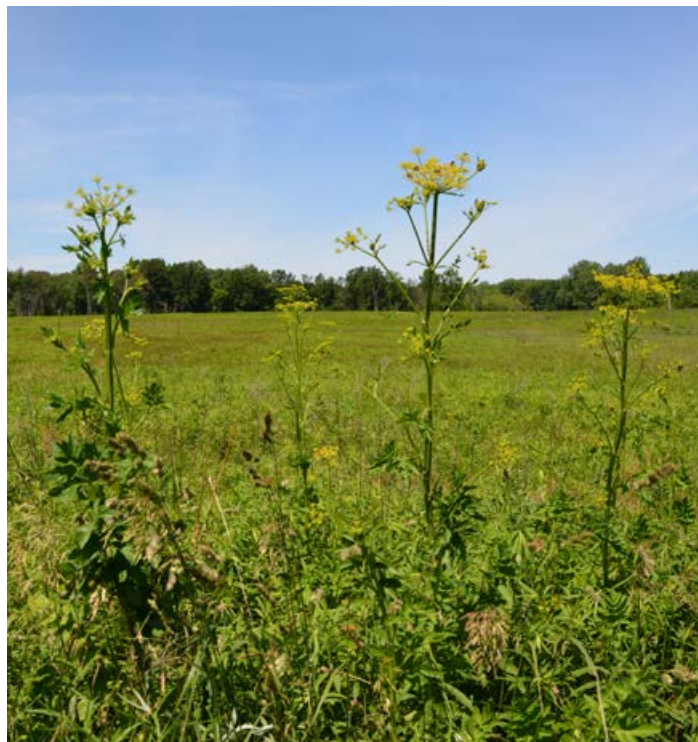
Wild parsnip is a nonnative invasive forb common in NWSG stands of the Midwest and northern United States.

Wild parsnip is an invasive biennial/perennial broadleaf common in planted NWSG stands and other early successional areas. Parsnip is most common in the Midwestern and northern U.S. and can cause phytophotodermatitis, a condition leading to rashes, blistering, and discoloration of the skin after contacting secretions from wild parsnip. Wild parsnip is controlled best with applications of 2,4-D (4 pt/ac), 2,4-D + triclopyr (4 qt/ac), or 2,4-D + dicamba (4–5.6 pt/ac), but also can be controlled with metsulfuron methyl (1.5–2 oz/ac), glyphosate (2 qt/ac), dicamba (2–4 pt/ac), and imazapyr (Arsenal®, 2–3 pt/ac).