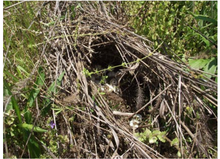
Bobwhite commonly use native grasses for nesting, but they also use dead material from a wide variety of other plants like giant foxtail. This picture illustrates the point that native grasses are not the only material bobwhite use for nesting, especially in areas where herbaceous vegetation is not lacking.

It is a common misconception that fields dominated by native grasses with very few “weeds” are best for wildlife. With the exception of grassland songbirds, there are no wildlife species in the eastern United States that need more than 30%–50% grass cover. Northern bobwhite, pheasants, and ground-nesting songbirds certainly use native grass litter for nesting, but they also will build nests from most any other herbaceous material and place nests near other vegetation that provides structure similar to grasses. For bobwhite, a density of 250 to 10,000 native-grass clumps per acre is more than sufficient for nesting