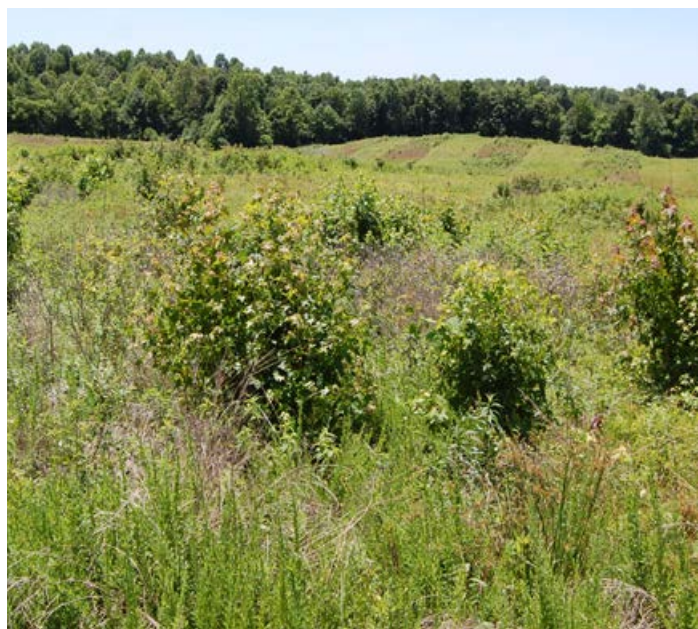
Pioneering tree species (sweetgum and red maple) and sericea lespedeza have invaded this field. In this case, a spot application of triclopyr would be most appropriate because it would control both tree species and sericea. This field could also be burned in late summer to reduce the woody encroachment and prevent sericea from producing seed.

Pioneering woody plants include tree species, such as winged elm, Virginia pine, red maple, sweetgum, yellow-poplar, cottonwood, green ash, black willow, sassafras, sweetgum, eastern redcedar, persimmon, black locust, and honeylocust. These species may provide vertical structure used for perching, thermal protection, or brooding or escape cover when they are young, but over time, they grow taller, out-compete herbaceous vegetation, and dominate the stand. That being said, make no mistake, the presence of some woody species makes the area much more attractive and productive for many wildlife species.