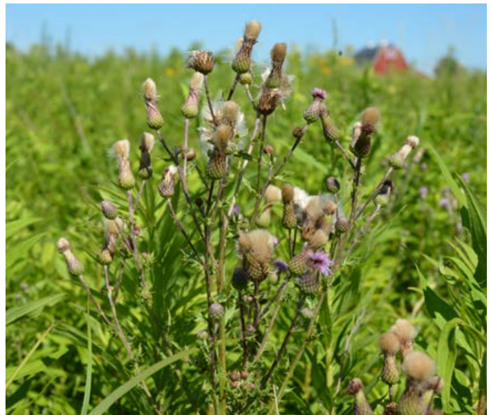
Nonnative biennial (musk thistle; left photo) and perennial (Canada thistle; above) thistles commonly invade NWSG stands and are most effectively controlled with herbicide.