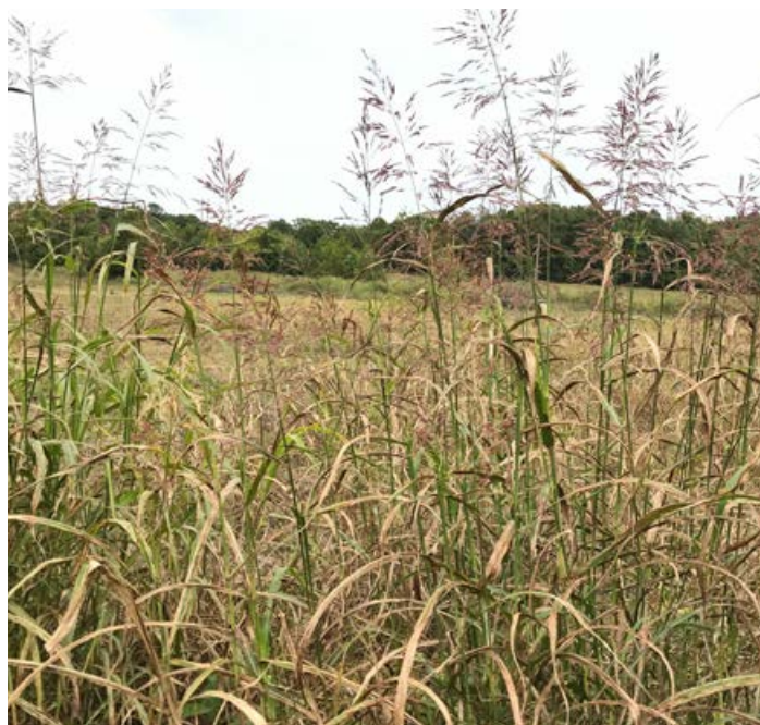
Johnsongrass can be problematic in NWSG stands and may be considered noxious in your state. Herbicide applications are the best option for controlling johnsongrass.

Johnsongrass is a nonnative perennial warm-season grass common in the southern United States. Johnsongrass is present at the time of NWSG establishment in many fields. Excessive johnsongrass can outcompete NWSG seedlings and reduce establishment success, which may lead to a failed planting. Johnsongrass will persist in established stands if left unmanaged, which can lead to a monoculture of johnsongrass that is dense, provides poor structure for some wildlife species, and offers little or no food if forbs are outcompeted. Seedling johnsongrass can be controlled preemergence with an application of imazapic (8 oz/acre). However, johnsongrass arising from rhizomes is not controlled with a preemergence application. Johnsongrass can be controlled postemergence in established NWSG stands with an application of imazapic (12 oz/ac) or sulfosulfuron (2 oz/ac) without harming many NWSG and desirable forbs. Many grasses planted in NWSG stands are tolerant of sulfosulfuron, whereas many grasses and forbs planted in NWSG stands are tolerant of imazapic (refer to herbicide label for specific species). Of course, spot-spraying johnsongrass with glyphosate (2% solution) is an option, if coverage of johnsongrass is not extensive.