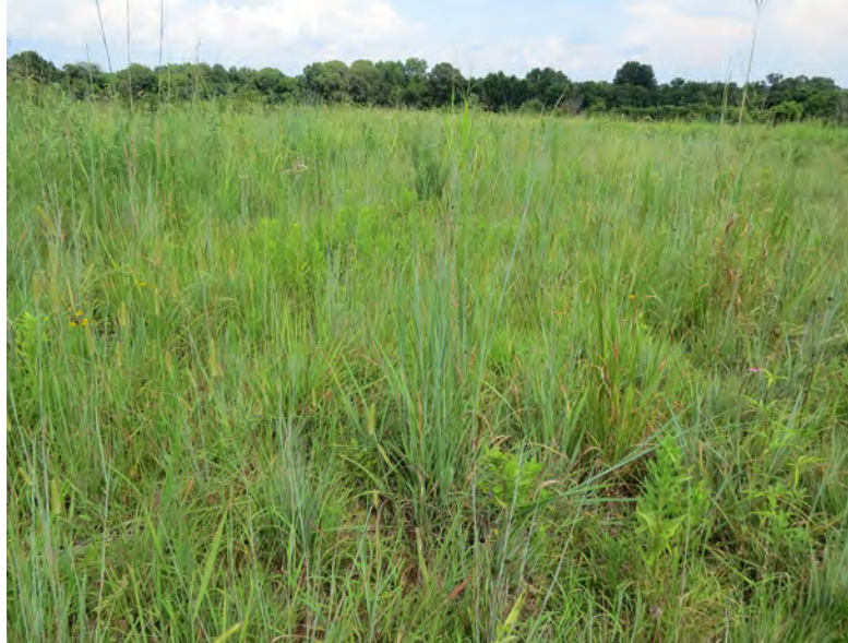
This field was in rowcrop production in 2015. Left: After three years of the natural revegetation treatment, native forbs and grasses have responded from the seedbank (NR). Right: The PL unit is dominated by little bluestem with fewer forbs.

treatments, which is critical to allow mobility and foraging for quail chicks and turkey poults.