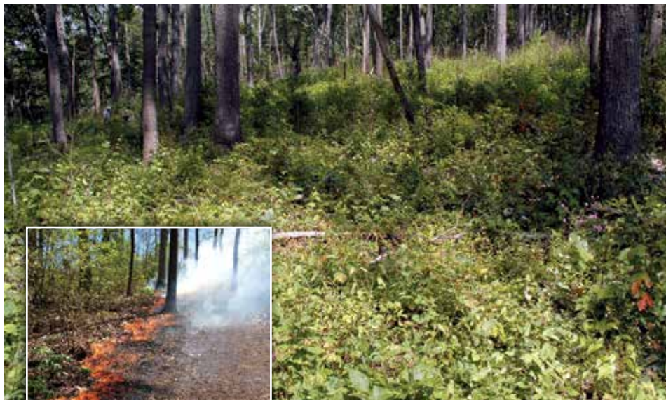
FIREBREAKS IN WOODS can be created easily with a backpack blower (left). This simple technique allows you to burn relatively small areas in woods, such as the half-acre seen above, for increased forage.

Consider getting a few friends to help you, and start small! You can clear a firebreak with a disk, a backpack sprayer, a rake, or a backpack blower and burn a