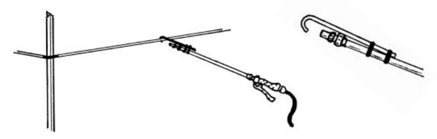
Figure 2. A hook attached to the sprayer nozzle aids in directing the repellent onto the fence.