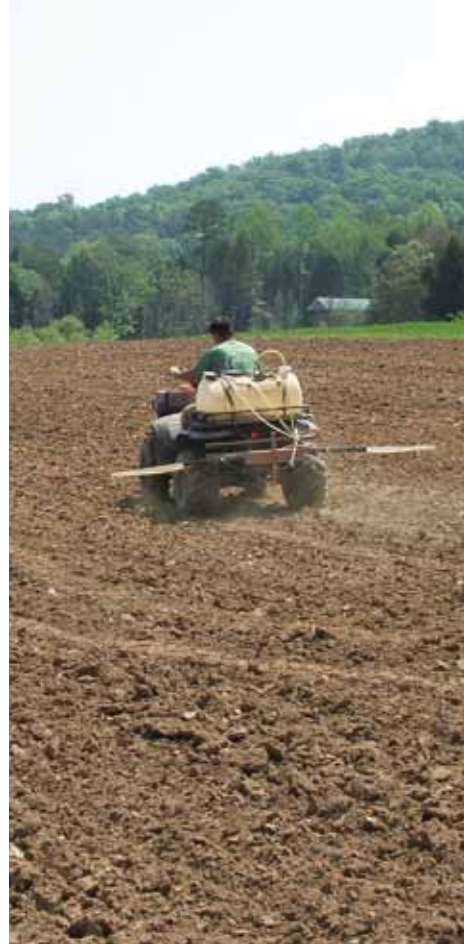
Preemergence herbicides are applied to the ground before weeds germinate.

There are crop-rotation restrictions with many preemergence and preplant incorporated herbicides. Because some of these herbicides may remain active in the soil for a few to many months, it is critical to plan ahead and keep notes on what you have sprayed. For example, imazethapyr, the active ingredient in Pursuit, can remain active for many months after planting. According to the Pursuit label, you should not plant alfalfa, clovers, rye, or wheat for four months after applying Pursuit. You should not plant corn for at least eight months after spraying Pursuit